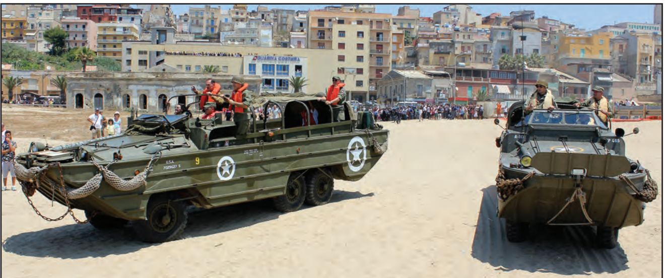
The two DUKWs on the historical landing beach followed two half-tracks used to compact the soft sand (A).