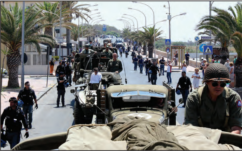
The Convoy, on promenade Federico II di Svevia, approaches the landing area where we met the US Ambassador and Italian authority. All vehicles were escorted by policemen on foot (A).