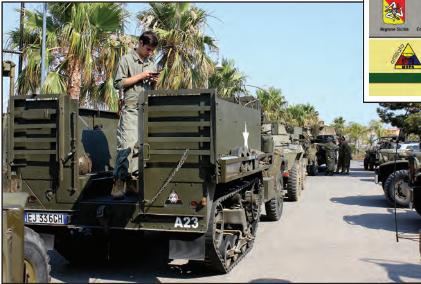
The official Task Force Husky poster.

Top. Some of the vehicles parked in Villa Peretti, our HQ in Gela (A). All our MVs arrived from Catania Harbor (H), Sicily along with some of our trailers. We chose a significant representation of WWII vehicles but no tanks on this long trip