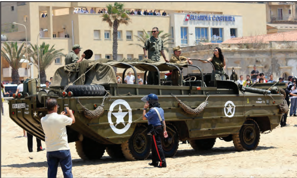
Gibertini's first DUKW just after it landed on the beach. Note the Coast Guard building in the background with the authorities on the terrace. The Carabinieri also escorted our MVs on the beach (A).