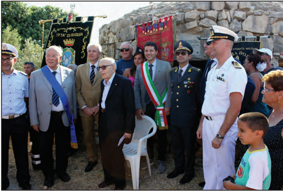
Italian authorities photographed in front of the Italian bunker in Case Camemi during a small ceremony (E).

who was posthumously awarded the Gold Medal for Valor – the Italian equivalent to the Medal of Honor – for his last stand in defense of the place against the advancing US troops. Another ceremony took place there in the presence of Italian authorities and then we again headed towards Ragusa (F). Under the hot afternoon sun