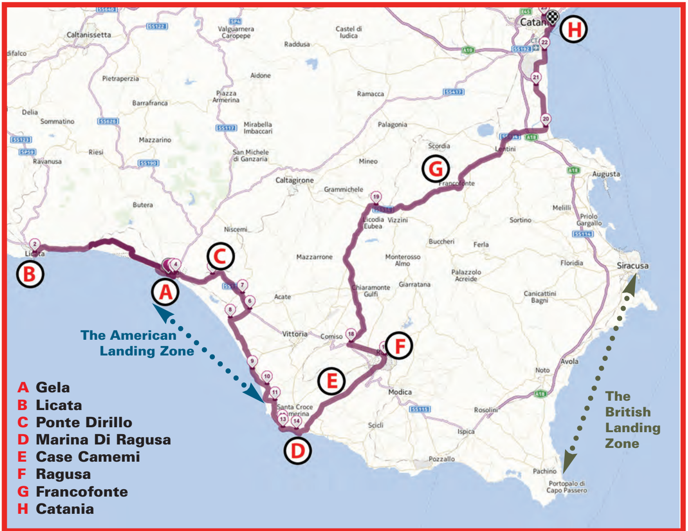
Map showing the key locations visited during the Task Force Husky event. The bracketed letters e.g. (A) in the article refer to the map locations.

For history buffs, however, Sicily is also where the Allied armies began their long and bloody trek to liberate Europe. The British, from their initial alliance with the US, had always advocated the roundabout way to Germany via Southern Europe. In late 1942, with strong British persuasion that strategy was accepted by the Americans, as the buildup for the projected European invasion was going much slower than expected and the Soviets were insisting on a 'second front' to distract Axis resources from the Eastern Front.