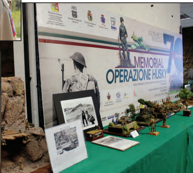
Catania Battle of Sicily Museum houses the Sicily Campaign model exhibition and photographs (H).