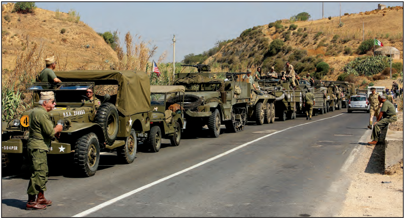
The Convoy parked on the road at the Ponte Dirillo monument. The thirty MVs, including the heavy vehicles, were easy to handle on the better than average wide Sicilian roads (C).