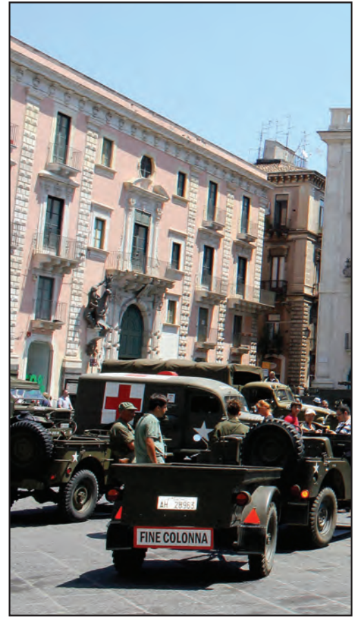
Light vehicles parked in Piazza Università in Catania (H).

Our adventure in Sicily had come to the end. We were proud and honored to have organized this event in commemoration of the 70th anniversary of the Sicily landings, which marked the beginning of the liberation of Europe from Fascism and Nazism. We were doubly happy, as while enjoying our hobby and the opportunity of touring beautiful Sicily with our military vehicles, we were also able to contribute to remembering those who were killed for our freedom while respecting the sacrifice of all who died in the service of their respective countries. We will not forget our week in Sicily and the personal emotions we felt during this event – it meant more than just an enjoyable trip in our HMV's.