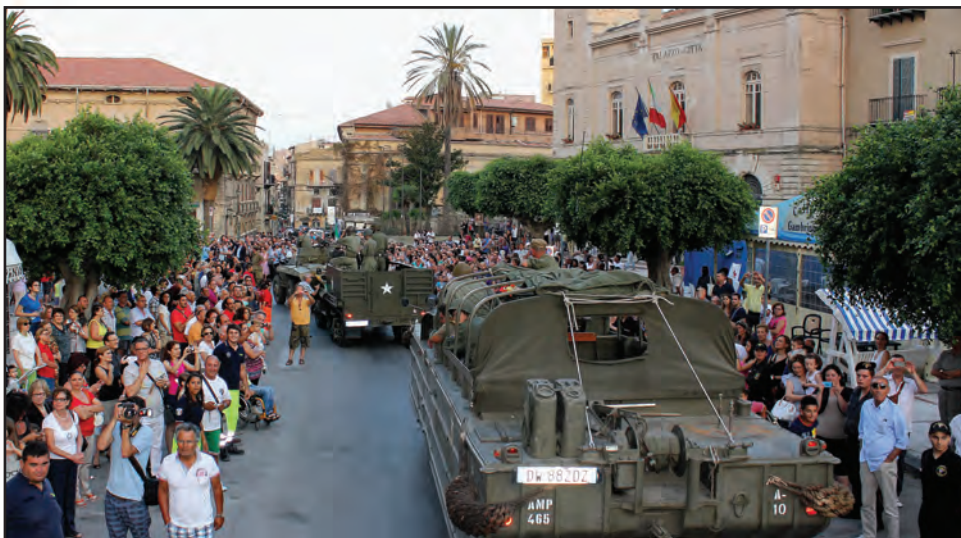
The Ford M8 Greyhound, M2A1 half-track and GMC DUKW enter in Licata as thousands of citizens welcomed us (B).