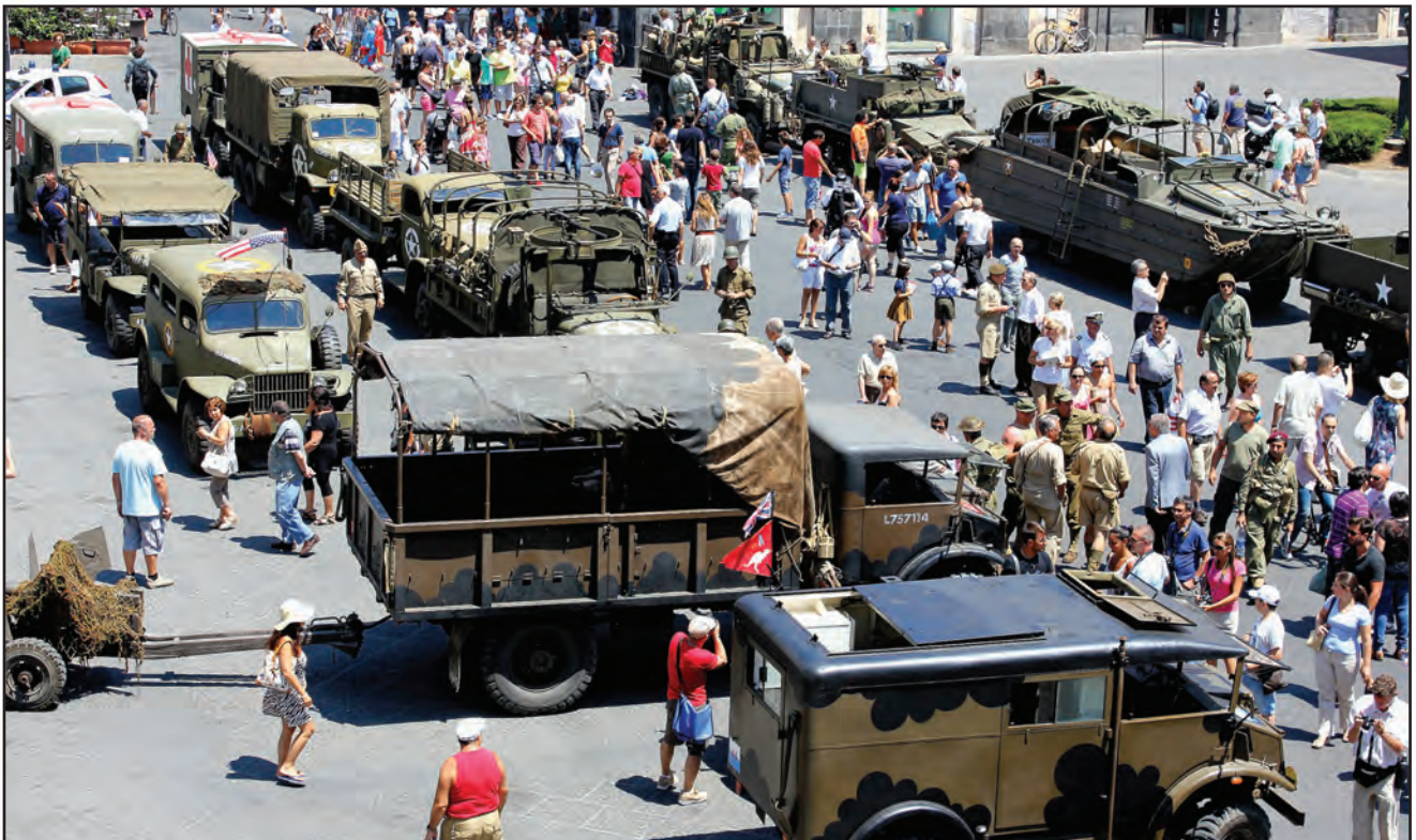
The convoy parked in the square at Università in Catania (H) marking the end of the Task Force Husky tour.