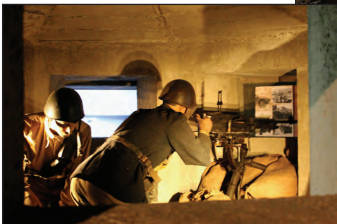
Catania Battle of Sicily Museum. This diorama, with an Italian bunker and machine gun, has great sound and dynamic effects (H).